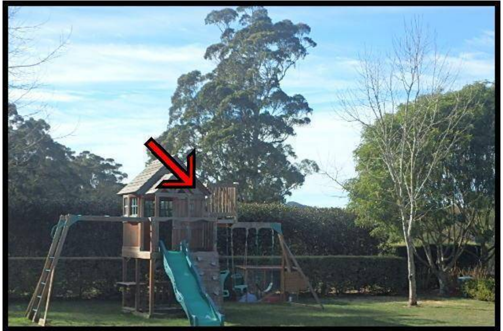
Child's cubby house: