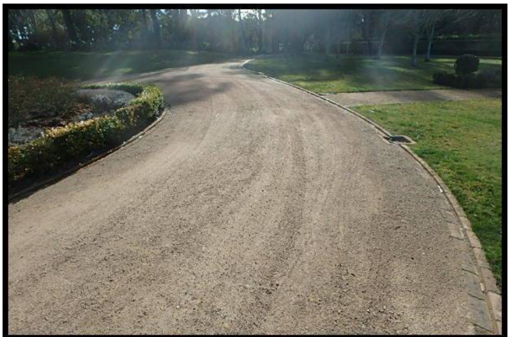
The gravel driveway stands in fair condition.

Fences Type & Condition: The fences are generally in good condition.