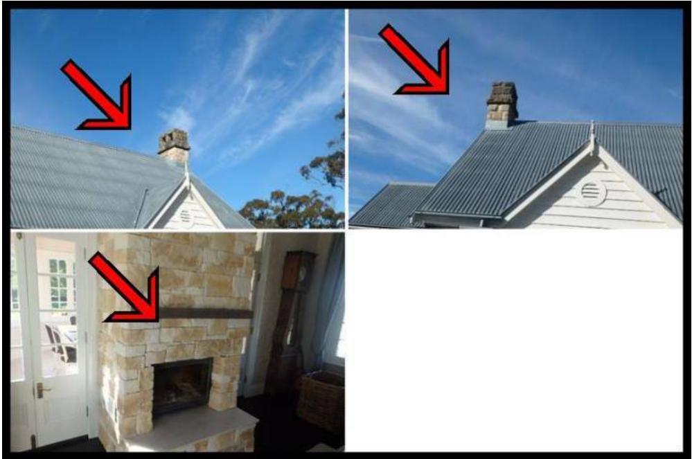
The flashing around the chimney is in good condition. The chimney should be tested and cleaned prior to being put into use.