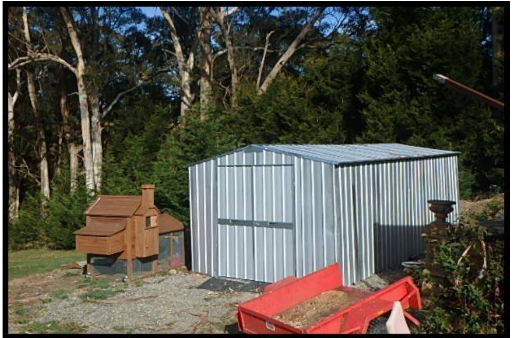
Metal garden shed: